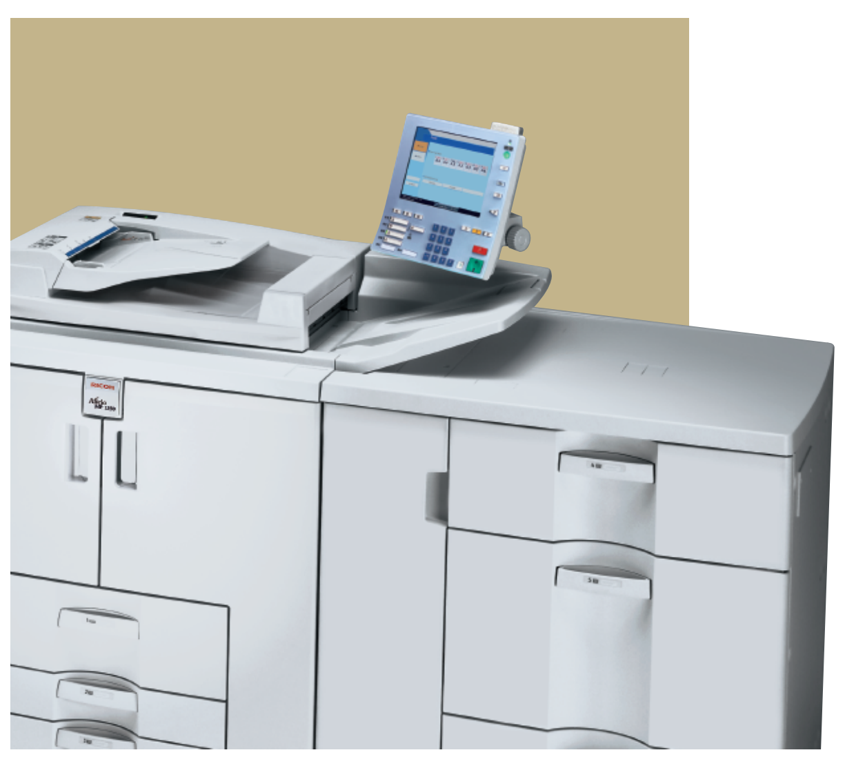
Aficio <sup>™</sup> MP 1100/MP 1350