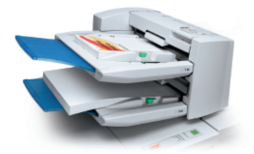
Easily insert front and back covers with the dual station cover feeder.

Including A3 charts and tables in an A4 presentation is very straightforward. The handy Z-folder unit automatically folds A3 sheets into A4, or A4 documents into A5 and allows for the seamless integration of larger sheets in smaller sized sets. The simple answer to complex jobs.